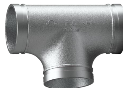
Model # T1