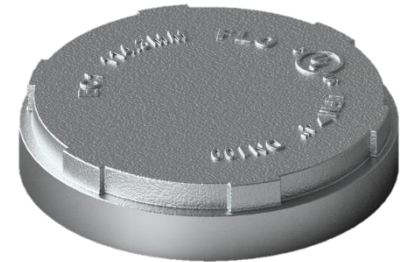
Model # EC1