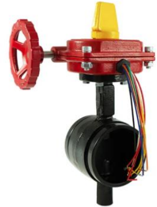
ALEUMTECH MODEL # HPG Fireiser HPG