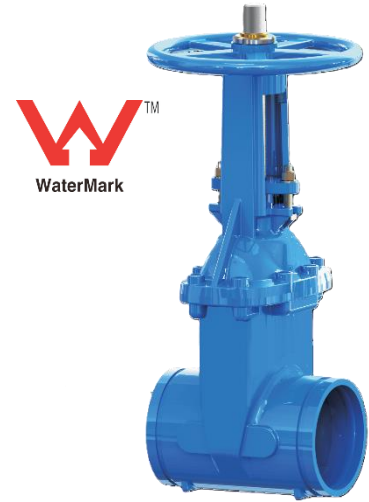
Model # F0122-300