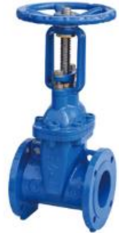
Model # XZ41X