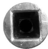
DN32 key →