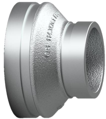
FLO Model # CR1